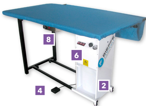
Models BF210, BF212, BF214 with board 151x81 cm