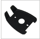
AR14 Black steamshade for Bieffe iron