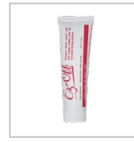
AR29 Iron cleanser paste