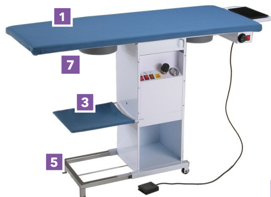
Models BF115, BF086, BF205 with board 143x51 cm

Ironing system composed of iron and rectangular ironing board