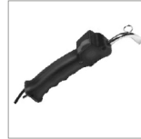
KITAV09 Steam gun kit