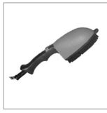
KITAV06 "Speedy" steam brush w/ilme plug