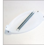
SIMPLE TEFLON SHOE