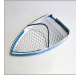
ARMURED TEFLON SHOE