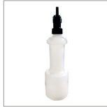
K2 Anti-drop bottle