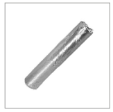
AR9 Iron cleanser stick