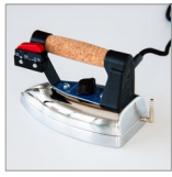
KITF002 Bieffe iron 1,7 kg w/ilme plug