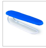
BF011 Sleeve board