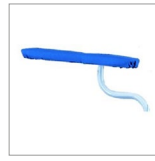
BF075 Suctioning bracket